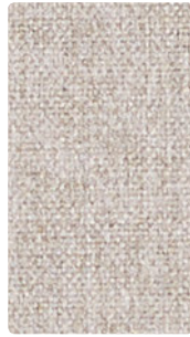
621-046 Light Grey